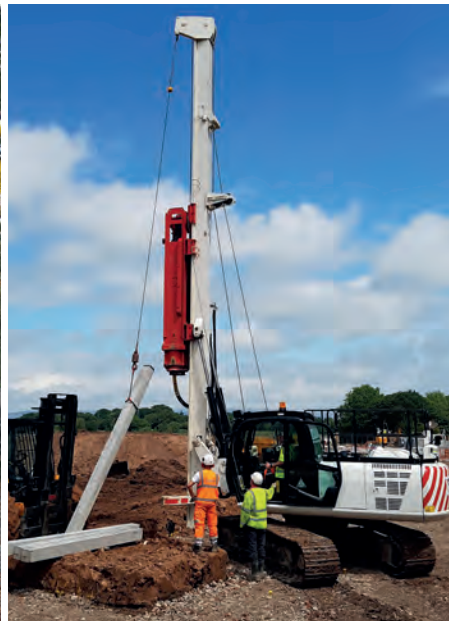
DX HAMMER MOUNTED ON JX25-8 PILING RIG