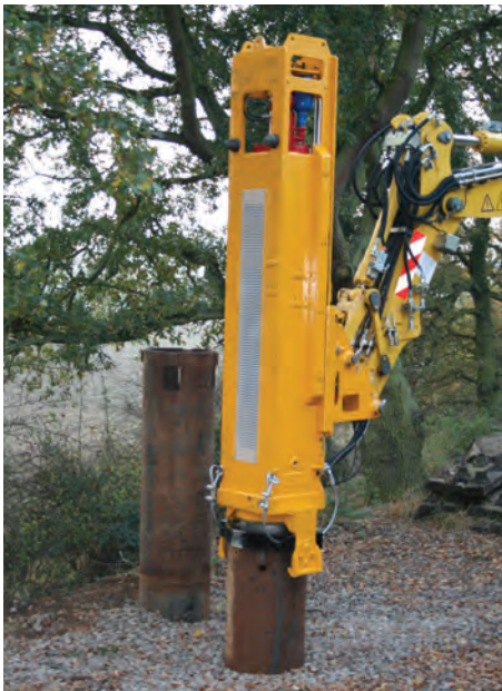
DX-RT DRIVING 610 TUBES