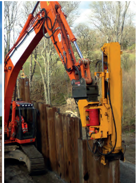
DX-SP DRIVING SHEET PILES

The DX range of hydraulic piling hammers are designed for small bearing piles of steel, timber, concrete and many sheet piles. The DX hammer is available with back guides for operating from a piling mast or a slider for operating from an excavator. The hammers have the following important features: