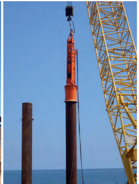
CX110, CRANE SUSPENDED AND FITTED WITH TUBE GUIDE

The CX range of piling hammers is designed for driving a wide variety of bearing and sheet piles. Available with legs and inserts or pile sleeves for use freely suspended, or with back guides for operating from a piling mast, the CX range has the following important features: