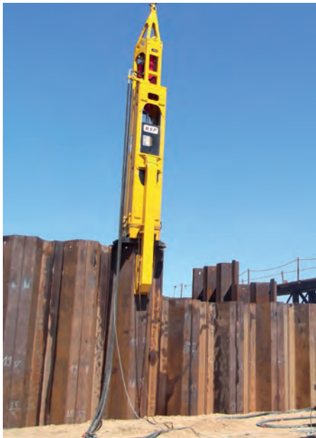
CX85, CRANE SUSPENDED AND FITTED WITH LEGS AND INSERTS FOR DRIVING SHEET PILES