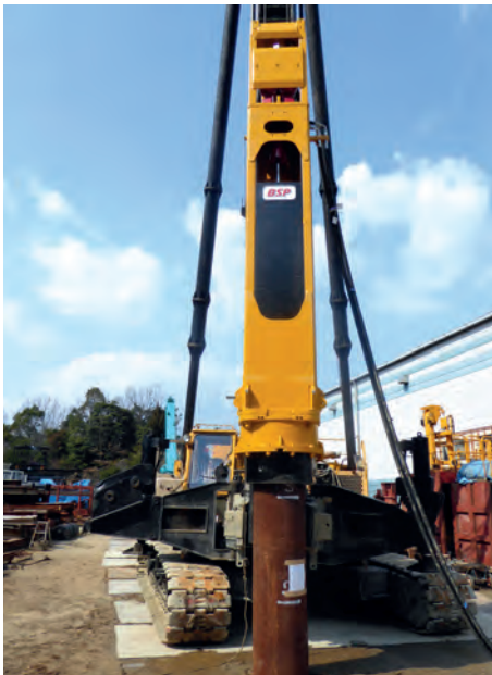
CX110, MOUNTED ON PILING RIG