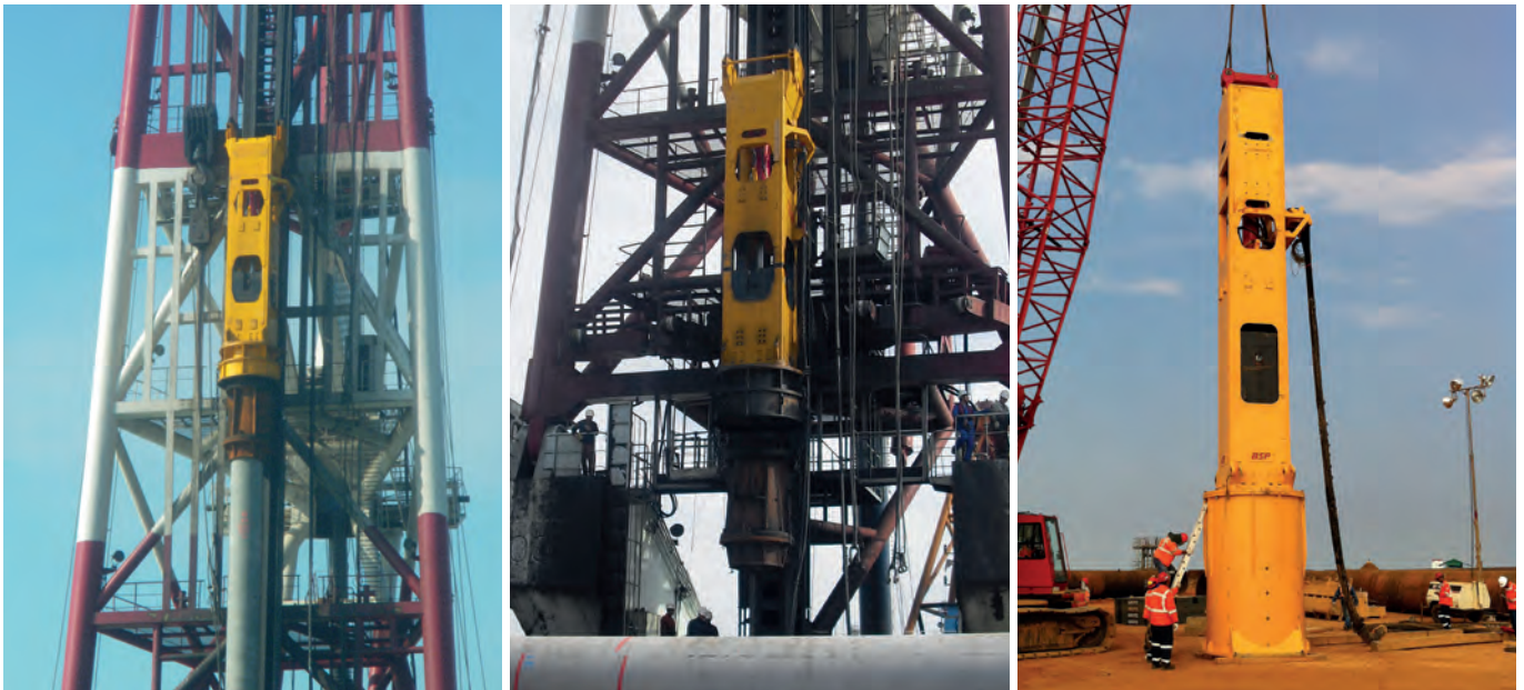
ABOVE: HAMMERS SHOWN IN LEADER MOUNTED OPERATION. CRANE SUSPENDED OPTION ALSO AVAILABLE.

The BSP range of large piling hammers shown here can be used freely suspended or configured with backguides for leader use. They include the following features: