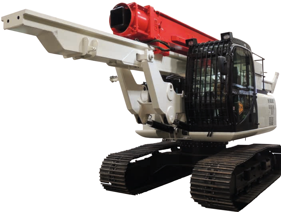
JX25-8 Dimensions Shown

Designed to be used with BSP's DX range of piling hammers, which provide a highly efficient hammer in a small envelope, maximising the pile lengths that can be driven.